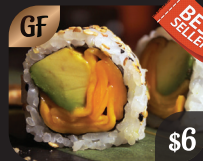
MANGO AVO $6