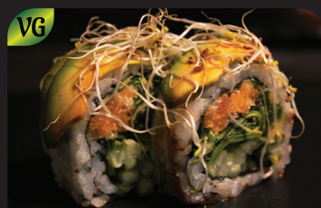
VG VEGETARIAN PARADISE $13 CUCUMBER, AVOCADO, MIXED GREENS AND TEMPURA FLAKES INSIDE. TOPPED WITH AVOCADO, MICRO SPROUTS AND SOY GLAZE.