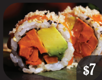
CRISPY SPICY YAM-AVO $7