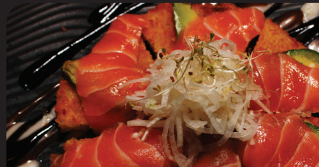
SUSHI PIZZA 6 PCS, PANKO BREADED SUSHI RICE TOPPED WITH YOUR CHOICE TOPPING AND SPECIAL SAUCE.