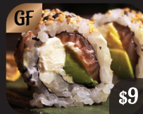
CHEESE SALMON AVOCADO $9