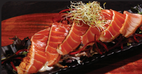
TATAKI (VG, GF) 6 PCS, JAPANESE FAMOUS FLAME TORCHED SASHIMI.