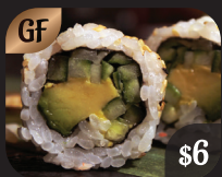
AVOCADO CUCUMBER $6