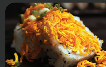
YAM GRAND $14 2 JUMBO SHRIMP TEMPURA, YAM, TEMPURA FLAKES, CREAM CHEESE, AVOCADO, TOPPED WITH SPICY MAYO, GREEN ONION.