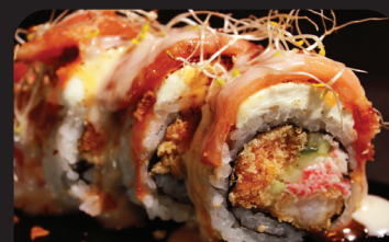
PHILLY RED DRAGON $17 FRESH SALMON SASHIMI, CREAM CHEESE, ONION AIOLI AND MICRO GREENS ON DYNAMITE ROLL.