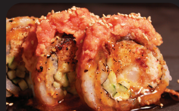
SPICY TUNA DRAGON $16 PLAZA SUSHI'S SPECIAL RECIPE SPICY TUNA MIXTURE WITH FURIKAKE TOPPED ON DYNAMITE ROLL. HALF SIZE $11