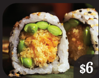
CRISPY EDAMAME $6