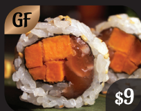
YAM SALMON $9