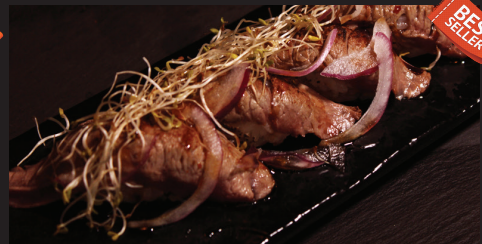
BEEF ABURI SUSHI (GF) $16 BEST SELLER 6 PCS, FLAME TORCHED BEEF TENDERLOIN SUSHI WITH SWEET AND GREEN ONION, SOY GLAZE DRIZZLE.