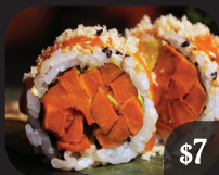
CRISPY SPICY YAM $7