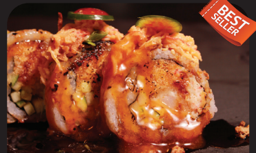
FIRE DRAGON $15 CRISPY SPICY TEMPURA FLAKES, SLICED JALAPENO, SRIRACHA SPICY SAUCE ON DYNAMITE ROLL. HALF SIZE $9