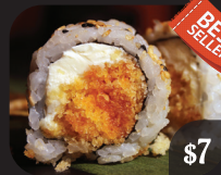
CRISPY SPICY CHEESE $7