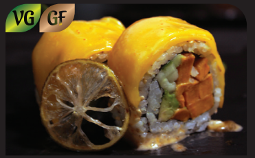
VG GF MANGO DRAGON $14 CUCUMBER, AVOCADO, BAKED YAM INSIDE. TOPPED WITH CREAM CHEESE, SLICED MANGO, MANGO SAUCE, SPICY MAYO, LIME ZEST.