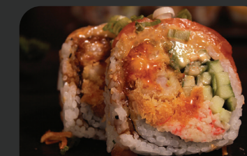
RED DOUBLE DYNAMITE $17 2 JUMBO SHRIMP TEMPURA, KANI SALAD, CUCUMBER, AVOCADO, TEMPURA FLAKES. TOPPED WITH THICK SALMON SASHIMI.