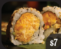
CRISPY SPICY MANGO $7