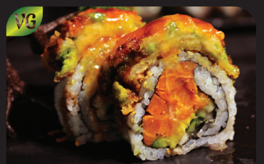
VG VEGGIE DELUXE $15 CUCUMBER, AVOCADO, BAKED YAM INSIDE. TOPPED WITH JAPANESE PANKO BREADED AVOCADO SLICES, SPICY MAYO AND TERIYAKI GLAZE.