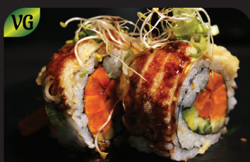
VG EGGPLANT DRAGON $14 PERFECTLY COOKED TEMPURA EGGPLANT ON VEGGIE DYNAMITE ROLL. TOPPED WITH SOY GLAZE, MICRO GREENS AND GREEN ONION.