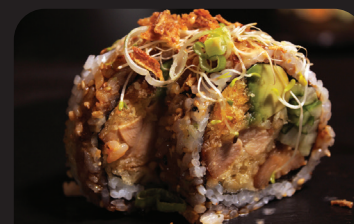
CHICKEN TEMPURA SUPREME $15 CUCUMBER, AVOCADO, TEMPURA FRIED CHICKEN TERIYAKI, CRUNCH. TOPPED WITH TERIYAKI GLAZE, GREEN ONION, CRISPY SHALLOT, MICRO GREENS.