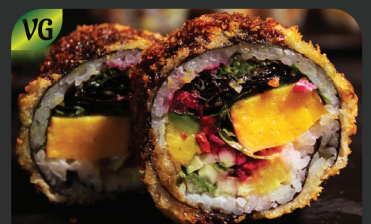
CRAZY FUTOMAKI $15 CUCUMBER, AVOCADO, RADISH, BEET, SHIITAKE MUSHROOM, TAMAGO. BREADED WITH PANKO, SERVED TERIYAKI SAUCE, MICRO GREENS.