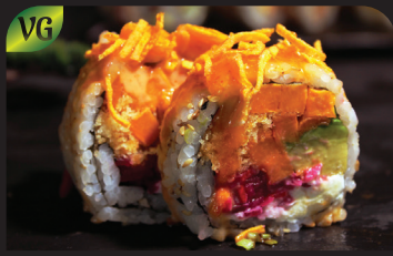
VG YAM YAM $15 BAKED YAM, AVOCADO, CREAM CHEESE AND PICKLED VEGETABLE AND TEMPURA FLAKES INSIDE. TOPPED WITH SPICY MAYO, YAM FRITS.