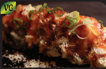
VG MANGO VOLCANO $15 TEMPURA FRIED ROLL. CUCUMBER, AVOCADO, CREAM CHEESE AND CRUNCH INSIDE. TOPPED WITH CHOPPED MANGO, SPICY MAYO, MANGO SAUCE.