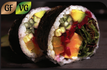
GF VG PLAZA FUTO MAKI $12 TRADITIONAL JAPANESE ROLL. SEAWEED OUTSIDE, CUCUMBER, AVOCADO, RADISH, SHIITAKE MUSHROOM, BEET, TAMAGO AND CRISPY SHALLOTS.