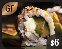
CHEESE AVOCADO $6