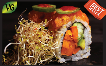
VG FIRE! VEGGIE DRAGON $15 CRISPY SPICY TEMPURA FLAKES, SLICED JALAPENO AND HOT SAUCE TOPPED ON VEGGIE DYNAMITE ROLL.