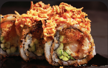
TIGER DRAGON $16 SHREDDED SPICY KANI SALAD, CRISPY SHALLOT, SOY GLAZE AND SPICY MAYO ON DYNAMITE ROLL. HALF SIZE $12