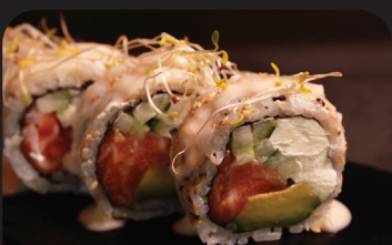
PHILADELPHIA $11 FRESH SALMON SASHIMI, CUCUMBER, AVOCADO, CREAM CHEESE, ONION AIOLI AND MICRO GREENS.