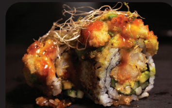
GREEN DELUXE $16 PANKO BREADED AVOCADO, SOY GLAZE, SPICY MAYO AND MICRO GREENS ON DYNAMITE ROLL.