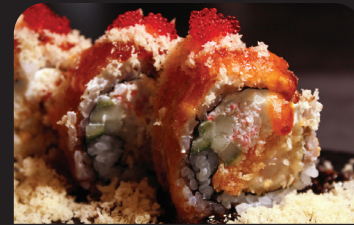
TNT $14 CREAM CHEESE, CUCUMBER, KANI SALAD, TEMPURA SHRIMP. TOPPED WITH TEMPURA FLAKES, SPICY MAYO, TOBIKO FISH EGGS AND SOY GLAZE.