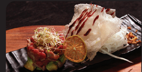
TARTARE (GF) $18 FRESH SASHIMI MINCED AND STACKED WITH AVOCADO. DRIZZLED WITH GINGER DRESSING, ONION AIOLI, TOBIKO FISH EGG, GREEN ONION. SERVED WITH RICE PAPER CHIPS.