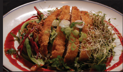
PORK KATSU / CHICKEN TERIYAKI SALAD $13 CHOICE OF PROTEIN ON OUR HOUSE SALAD, GINGER DRESSING AND SPECIAL KATSU SAUCE FOR PROTEIN.