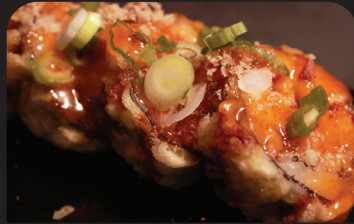
GOLDEN CALIFORNIA $11 TEMPURA FRIED JUMBO CALIFORNIA ROLL TOPPED WITH SPICY MAYO, SOY GLAZE AND GREEN ONION.