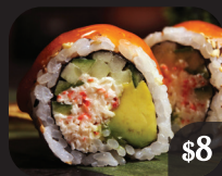
SPICY CALIFORNIA $8