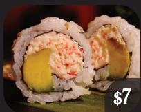
CRAB AVOCADO $7