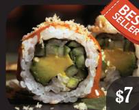
CRISPY SPICY AVO-Q $7