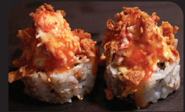
VOLCANO $16 CHEESE LOVER! CUCUMBER, AVOCADO, CREAM CHEESE INSIDE. TOPPED WITH SPICY SHREDDED KANI SALAD, SPICY MAYO, CRISPY SHALLOT AND SOY GLAZE.