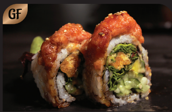
GF TUNA FRESH $15 SPECIAL SPICY TUNA TOPPED ON AVOCADO, MIXED GREENS AND CUCUMBER ROLL. TAMARI GLAZE AND SPICY MAYO ON TOP.