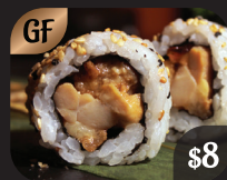
BBQ CHICKEN $8