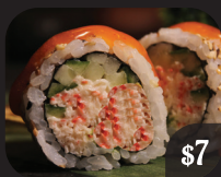
SPICY CRAB $7