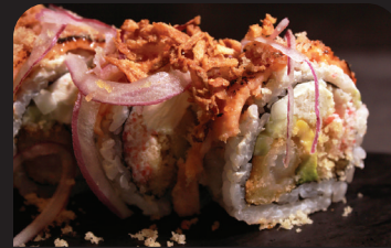
PLAZA DELUXE $19 OUR ORIGINAL DYNAMITE ROLL TOPPED WITH CREAM CHEESE, TORCHED SALMON SASHIMI, SWEET ONION, CRISPY SHALLOT AND SPICY MAYO.