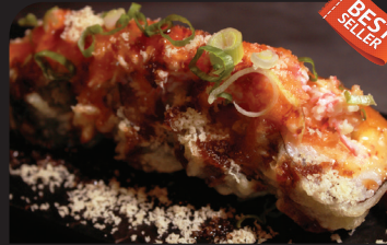
VOLCANO CALIFORNIA $15 SHREDDED KANI SALAD, SPICY MAYO, SOY GLAZE, GREEN ONION TOPPED ON CRUNCHY GOLDEN CALIFORNIA.