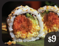
CRISPY SPICY TUNA $9