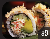
SNOW CALIFORNIA $9