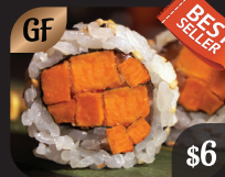
BAKED YAM $6