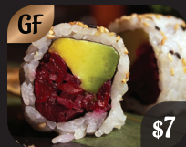
PICKLE VEGGIE & AVO $7