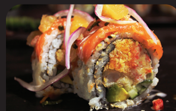
SALMON SALAD $15 SALMON SASHIMI, ZESTY PINEAPPLE SALSA, SWEET ONION AND ONION AIOLI TOPPED ON CUCUMBER, AVOCADO, KANI SALAD ROLL.