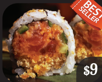
CRISPY SPICY SALMON $9