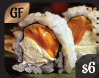
MANGO CHEESE $6