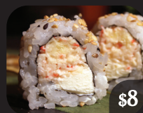
CHEESE CRAB $8