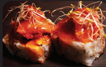
SPICY TUNA SUPREME $17 PLAZA SUSHI'S SPECIAL RECIPE TUNA, MICRO GREENS, TOBIKO FISH EGGS TOPPED ON CUCUMBER, AVOCADO, CREAM CHEESE AND CRUNCH ROLL.