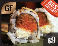
SPICY TUNA CHEESE $9