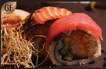
GF RAINBOW FRESH $15 5 KINDS OF ASSORTED SASHIMI, TOBIKO, FISH EGG AND TAMARI GLAZE ON CUCUMBER, AVOCADO, MIXED GREEN ROLL.