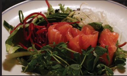
SALMON LOVER SALAD (GF) $12 FRESH SALMON SASHIMI AND AVOCADO TOPPED ON HOUSE SALAD, GINGER DRESSING.