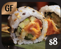
SPICY SALMON $8