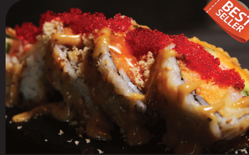
DOUBLE DYNAMITE $15 PLAZA SUSHI'S FAVOURITE. 4 JUMBO TEMPURA SHRIMPS, DOUBLE PORTION KANI SALAD, CUCUMBER, AVOCADO. TOPPED WITH SPICY MAYO AND TERIYAKI SAUCE.