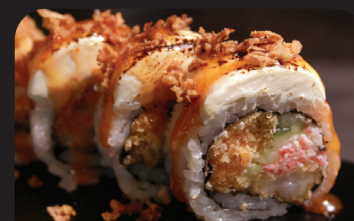
PHILLY ON FIRE $16 DYNAMITE ROLL WITH TORCHED CREAM CHEESE, SPICY MAYO AND CRISPY SHALLOT ON TOP. HALF SIZE $11