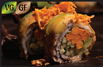
VG GF VEGGIE DRAGON $13 SLICED AVOCADO, MICRO GREENS, SPICY MAYO AND TAMARI GLAZE TOPPED ON VEGGIE DYNAMITE ROLL.