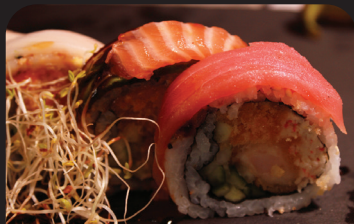
RAINBOW DRAGON $15 5 KINDS ASSORTED SASHIMI, TOBIKO FISH EGG AND SOY GLAZE TOPPED ON DYNAMITE ROLL.