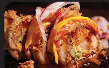
MANGO RED DRAGON $18 SLICED APPLE MANGO, SALMON SASHIMI, ZESTY PINEAPPLE SALSA AND SPICY MAYO TOPPED ON DYNAMITE ROLL.