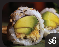
CRISPY SPICY AVOCADO $6