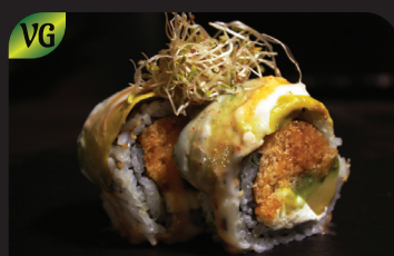
VG AVO-AVO $14 AVOCADO LOVERS! AVOCADO, CREAM CHEESE AND CRUNCH INSIDE. TOPPED WITH SLICED AVOCADO, MICRO GREENS, ONION AIOLI AND SPICY MAYO.