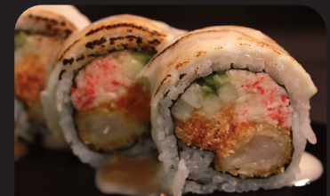
SNOW DRAGON $17 TORCHED BUTTERFISH SASHIMI, ONION AIOLI, SOY GLAZE AND GREEN ONION WITH DYNAMITE ROLL.