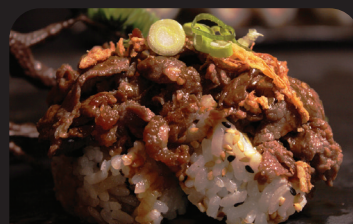
LOADED BULGOGI $18 SURF & TURF. TEMPURA SHRIMP, KANI SALAD, CUCUMBER ROLL. TOPPED WITH BULGOGI BBQ BEEF, SPICY BLACK GARLIC AIOLI, TERIYAKI GLAZE AND CRISPY SHALLOT.