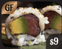
TUNA AVOCADO $9