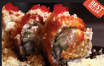
SPIDER SUPREME $21 WHOLE SOFT SHELL CRAB TEMPURA, CUCUMBER, AVOCADO, KANI SALAD. TOPPED WITH TOBIKO FISH EGG, SPICY GARLIC MAYO, TERIYAKI SAUCE, GREEN ONION.