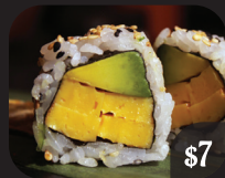
TAMAGO AVOCADO $7