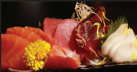
SASHIMI SAMPLER (GF) $15 8 PCS, ASSORTED SASHIMI.