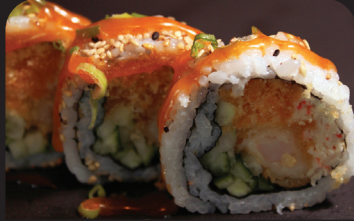
SPICY DYNAMITE $12 CUCUMBER, KANI SALAD, CRUNCH, 2 JUMBO SHRIMP. TOPPED WITH TERIYAKI AND GREEN ONION HALF SIZE $8.5