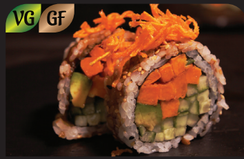
VG GF VEGGIE-DYNAMITE $11 CUCUMBER, AVOCADO, BAKED YAM INSIDE. TOPPED WITH CRUNCHY FRITS AND TERIYAKI GLAZE.