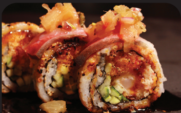
HAWAIIAN HAMACHI $17 FRESH YELLOWTAIL SASHIMI, ZESTY PINEAPPLE SALSA, SOY GLAZE TOPPED ON DYNAMITE ROLL. HALF SIZE $11