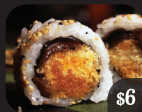
CRISPY SHIITAKE $6