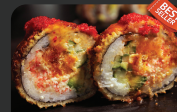
CRAZY CALIFORNIA $15 KANI SALAD, CUCUMBER, AVOCADO, TEMPURA FLAKES INSIDE. PANKO FRIED, SERVED WITH TOBIKO FISH EGGS, SPICY MAYO AND TERIYAKI.