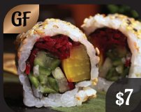
VEGGIE CALIFORNIA $7