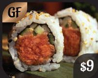
SPICY TUNA $9