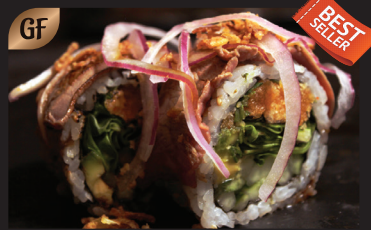
GF BEEF ABURI $18 AVOCADO, CUCUMBER, MIXED GREENS. TOPPED WITH TORCHED BEEF TENDERLOIN, TAMARI GLAZE, CRISPY SHALLOT, SWEET ONION.