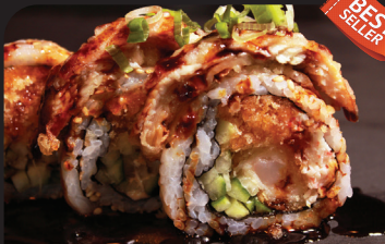
BLACK PLAZA DRAGON $17 TORCHED BBQ EEL TEMPURA, FISH EGGS, GREEN ONION, MICRO GREENS WITH TERIYAKI SAUCE ON DYNAMITE ROLL.