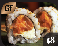
SPICY SALMON CHEESE $8