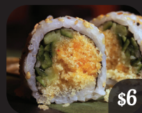
CRISPY CUCUMBER $6