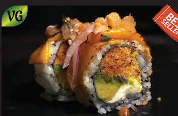
VG MANGO 'ROCK N ROLL' $14 TORCHED SLICED MANGO, ZESTY PINEAPPLE SALSA, SWEET ONION, SPICY MAYO TOPPED ON AVOCADO, CREAM CHEESE AND CRUNCH ROLL.