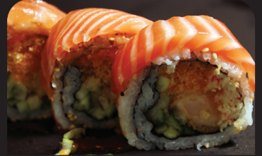
RED DRAGON $15 FRESH SALMON SASHIMI WITH SPICY MAYO AND MICRO GREENS ON DYNAMITE ROLL. HALF SIZE $9