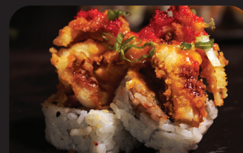
LOADED CALAMARI $18 JAPANESE PANKO BREADED SQUID, GREEN ONION, TOBIKO FISH EGG, SPICY GARLIC MAYO AND TERIYAKI TOPPED ON DYNAMITE ROLL.