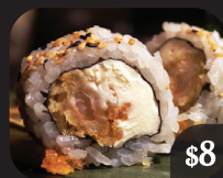
CHEESE SHRIMP $8