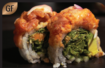
GF SPICY SALMON FRESH $15 AVOCADO, CUCUMBER, MIXED GREENS, CRUNCH INSIDE. TOPPED WITH TORCHED SPICY SALMON, SPICY MAYO AND SWEET ONION.