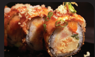
519 PLAZA $18 #1 SELLER. CRUNCH GOLDEN DYNAMITE TOPPED WITH THICK SALMON SASHIMI, GREEN ONION, FISH EGGS, SOY GLAZE AND SPICY MAYO.