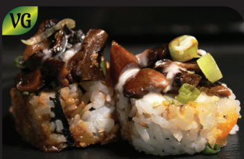
VG MUSHROOM SPECIAL $15 FINELY CHOPPED SHIITAKE AND GREEN ONION TOPPED ON CUCUMBER, AVOCADO, CREAM CHEESE AND CRUNCH ROLL.