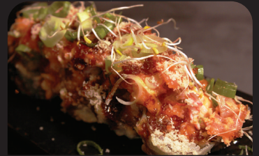
LAS VEGAS $16 TEMPURA FRIED ROLL WITH CUCUMBER, AVOCADO, CREAM CHEESE AND CRUNCH INSIDE. TOPPED WITH SPICY TUNA, SPICY SALMON, KANI SALAD AND MICRO GREENS WITH 2 SPECIAL SAUCES.