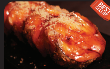
GOLDEN DYNAMITE $13 CRUNCHY JAPANESE PANKO BREADED DYNAMITE ROLL WITH 2 SPECIAL SAUCES AND GREEN ONION.