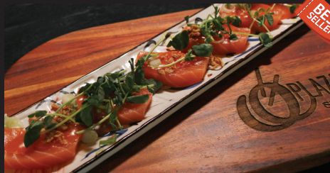
SPICY SALMON SASHIMI (GF) $14 BEST SELLER 6 PCS, FRESH SALMON SASHIMI WITH SPICY MAYO AND CRISPY SHALLOT