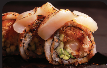
SCALLOP DRAGON $18 TORCHED SCALLOP AND LIME ZEST WITH SOY GLAZE SAUCE ON DYNAMITE ROLL. HALF SIZE $11