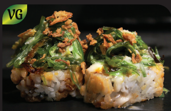
VG SEA FOREST $14 CHOPPED SEAWEED SALAD, CRISPY SHALLOT, ONION MAYO AND SOY GLAZE TOPPED ON CUCUMBER, AVOCADO AND CREAM CHEESE ROLL.