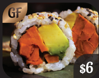
YAM AVOCADO $6