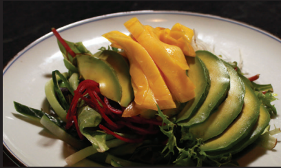
MANGO SALAD (VG, GF) $12 SLICED APPLE MANGO AND AVOCADO ON OUR HOUSE SALAD WITH A GINGER DRESSING AND MICRO GREENS.