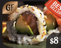
SALMON AVOCADO $8