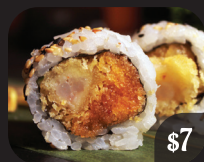
TEMPURA SHRIMP $7