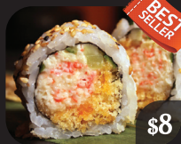
CRISPY SPICY CRAB $8