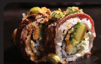
BEEF TERIYAKI SUPREME $19 ABURI STYLE TORCHED TENDER BEEF SLICES TOPPED ON AVOCADO, CUCUMBER, CRUNCH AND CREAM CHEESE ROLL. SOY GLAZE, ONION AIOLI, GREEN ONION AND CRISPY SHALLOT ON TOP.