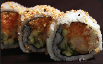
DYNAMITE $11 CUCUMBER, KANI SALAD, CRUNCH, 2 JUMBO SHRIMP. TOPPED WITH TERIYAKI AND GREEN ONION HALF SIZE $8