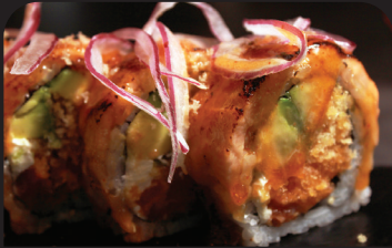
'ROCK N ROLL' $15 GLUTEN FREE AVAILABLE TORCHED SALMON SASHIMI, SWEET ONION, SPICY MAYO TOPPED ON AVOCADO, CREAM CHEESE AND CRISPY SPICY SALMON ROLL.