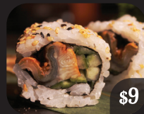
EEL CUCUMBER AVOCADO $9