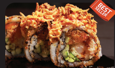
JACKED TIGER DRAGON $18 SPRINKLE OF SUGAR ON TIGER DRAGON AND BRULEED FOR CRUNCH TEXTURE. HALF SIZE $13