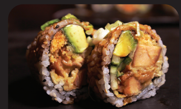
CHICKEN TERIYAKI $11 CUCUMBER, AVOCADO, CHICKEN TERIYAKI, CRUNCH INSIDE. TERIYAKI SAUCE, GREEN ONION ON TOP.