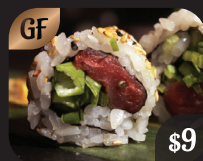
TUNA GREEN ONION $9