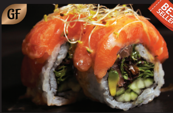
GF DOUBLE SALMON $16 SALMON LOVER'S FAVOURITE. AVOCADO, MIXED GREENS AND CUCUMBER INSIDE. TOPPED WITH THICK SALMON SASHIMI AND SPICY MAYO, MICRO GREENS.